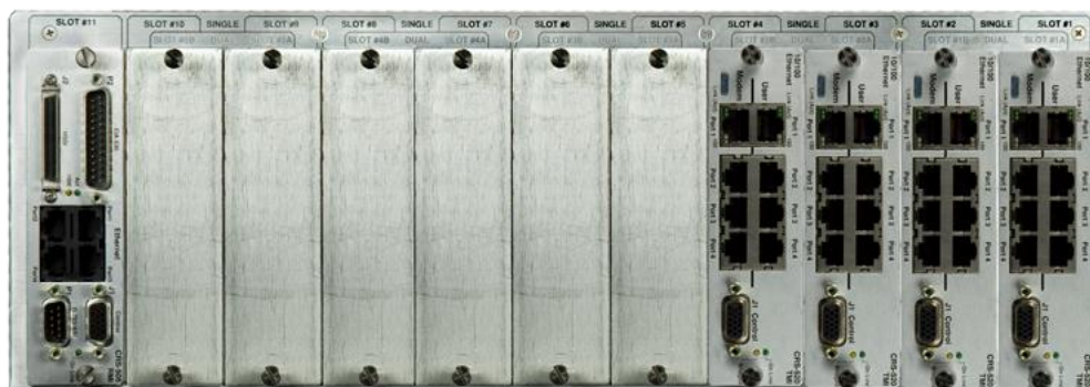
Data Switch Unit (DSU), Front View