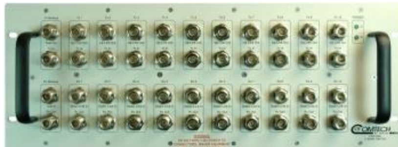
CRS280 or CRS-280L