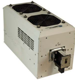
Model PS 1.5