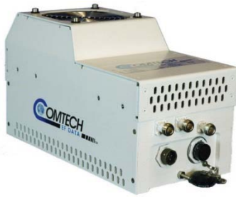
Model PS 1