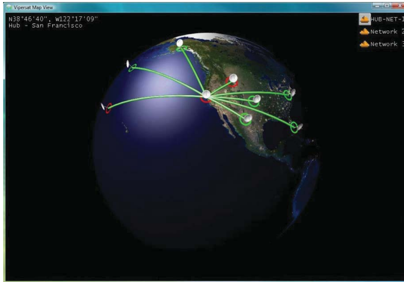
VMS Map View Displays Vessels/Vehicles On-the-Move