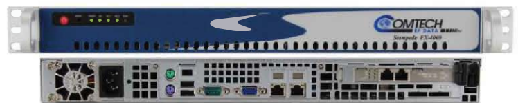
FX-4000 Front & Back Panel 4