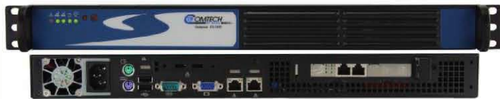
FX-1000 Front & Back Panel 4