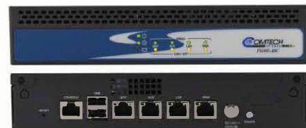
FX-1005 Front & Back Panel 4