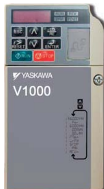
Yaskawa V1000 Motor Controller Drives