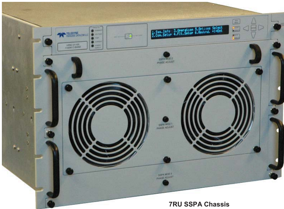
7RU SSPA Chassis