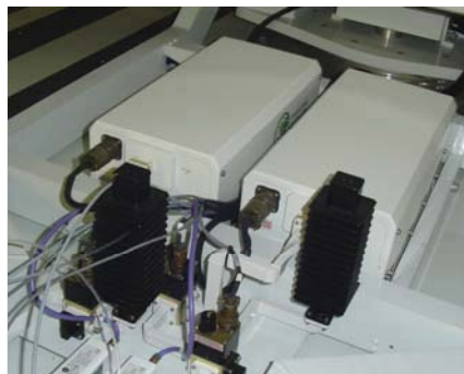
SNG-mount 1:1 system w/ side-mount AC input