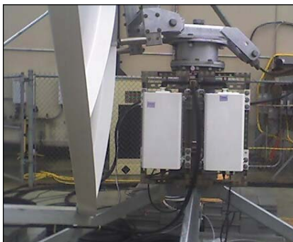
Antenna-mount 1:1 system w/ mounting frame