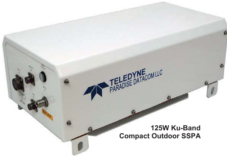
125W Ku-Band Compact Outdoor SSPA