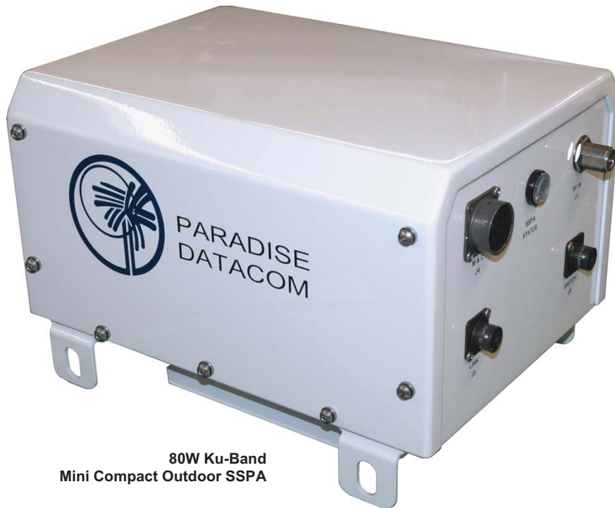
80W Ku-Band Mini Compact Outdoor SSPA